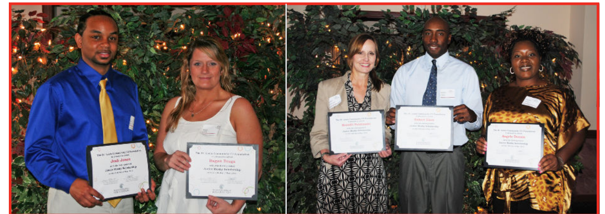
2011 Scholarship Winners

Education is the passport to opportunity. The Janice Mosby Scholarship helps create a successful path for aspiring achievers and lifelong learners.